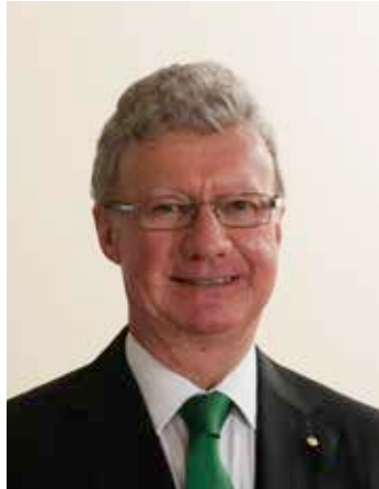
His Excellency the Honourable Paul de Jersey AC , Governor of Queensland, Patron