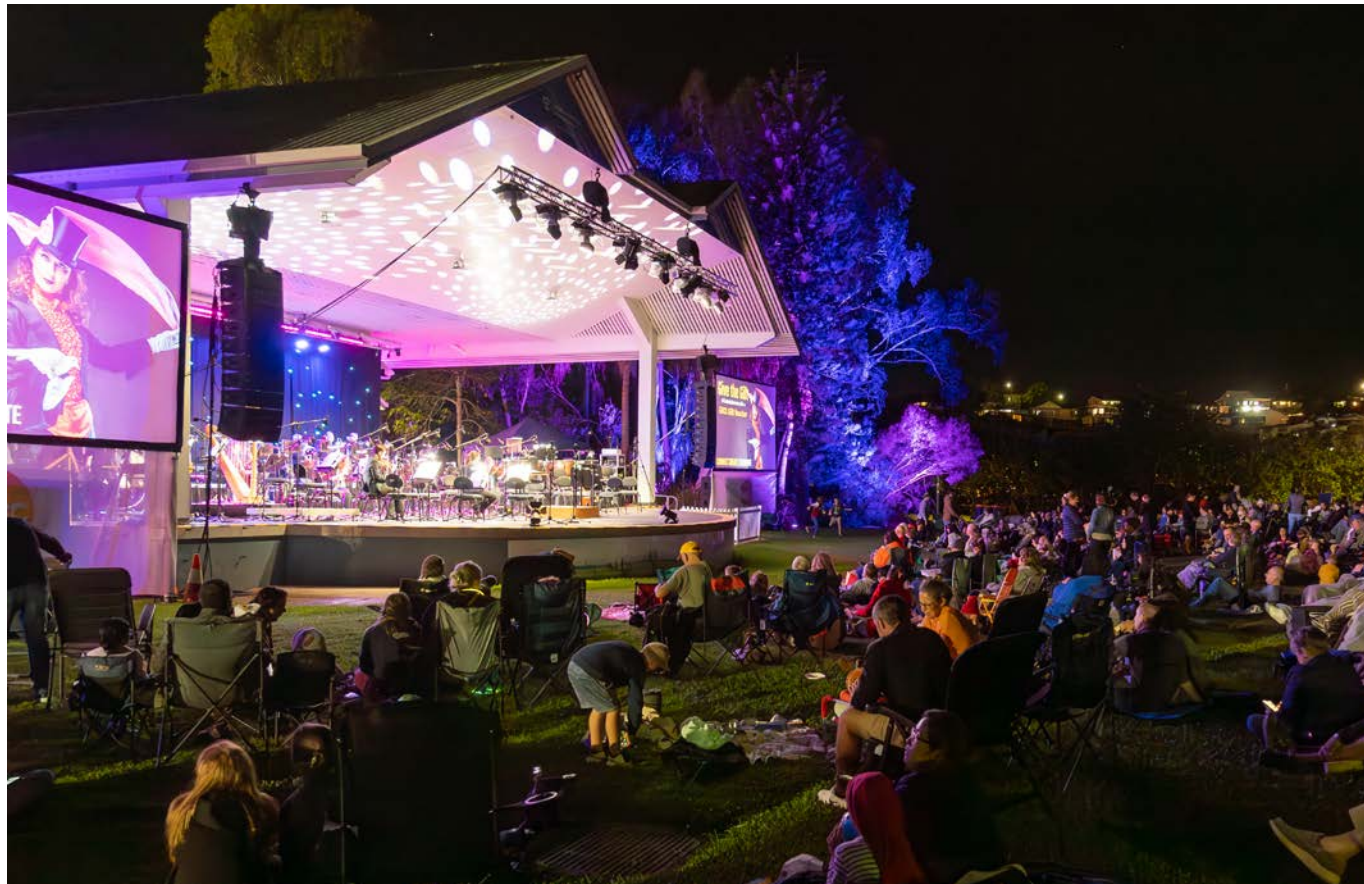
Symphony Under the Stars, Gladstone, Queensland