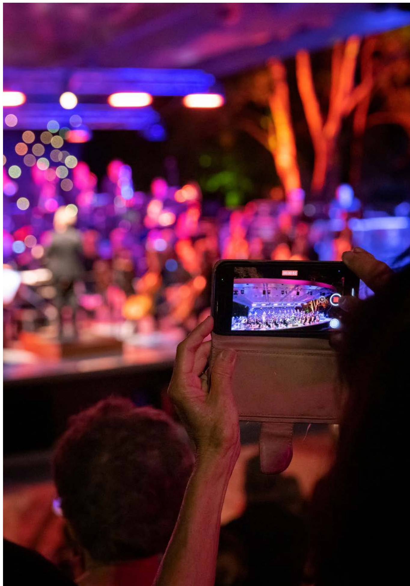
Symphony Under the Stars, Gladstone, Queensland