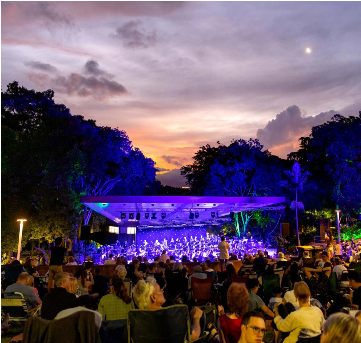
Symphony Under the Stars, Roma St Parklands Brisbane, Queensland